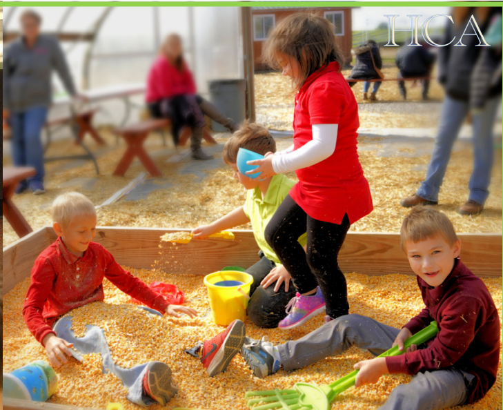
Too Much Fun!